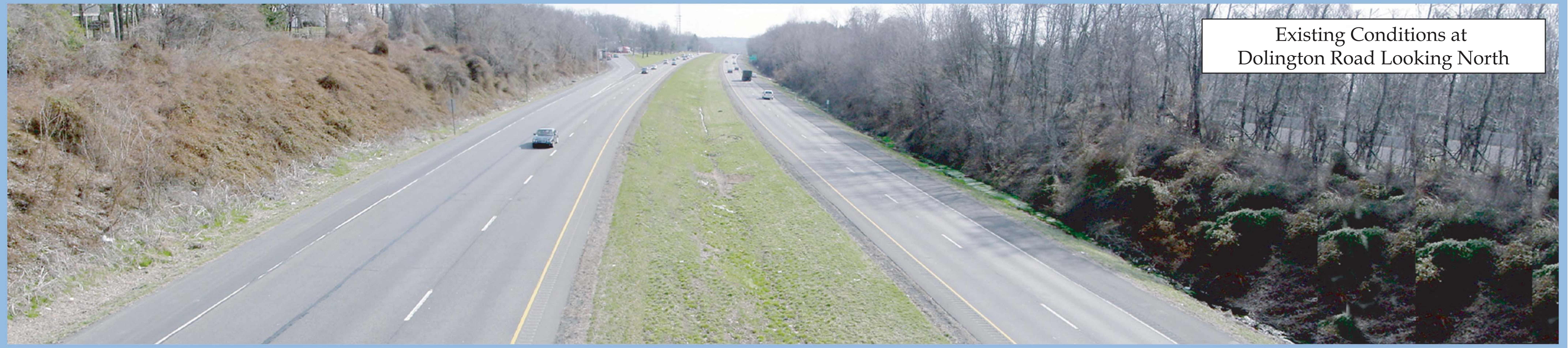
Existing Conditions at Dolington Road Looking North